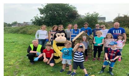
Ashbourne River Family Fun Day

Our Catchment Scientists have delved into another set of public meetings, in September, public meetings were held in: Lough Derravaragh Priority Area for Action (PAA) comprising the Yellow and Gaine rivers and Lough Lene PAA (Adeel Stream). Farmer specific meetings will be scheduled in the coming weeks.