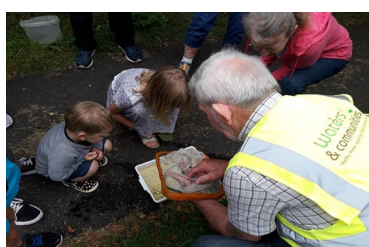
Rathangan Waterways Biodiversity Walk