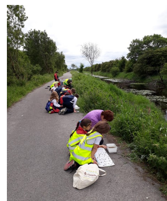
Athlone Canal Heritage Group – Walk & Talk Tour

Water Heritage Day is organised as a collaboration between The Heritage Council and the Local Authority Waters Programme to celebrate water and our connections with it. Throughout Heritage Week and on Water Heritage Day, Sunday 25th August, communities organised events beside their local well, river, lake, canal and coast. Over 60 events took place around the country and were supported by staff of the Local Authority Waters Programme. This was an opportunity to enjoy the wildlife and learn more about the habitats along our waterways. Some of the events in this region included Athlone Canal Heritage Tour (right), a family day exploring the shores of Lough Ree, Ashbourne River Family Fun Day (below right) and Rathangan River and Canal Walk (below).